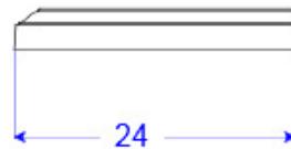
WC 12 TER 9"W x 24"L x 3 1/2"H